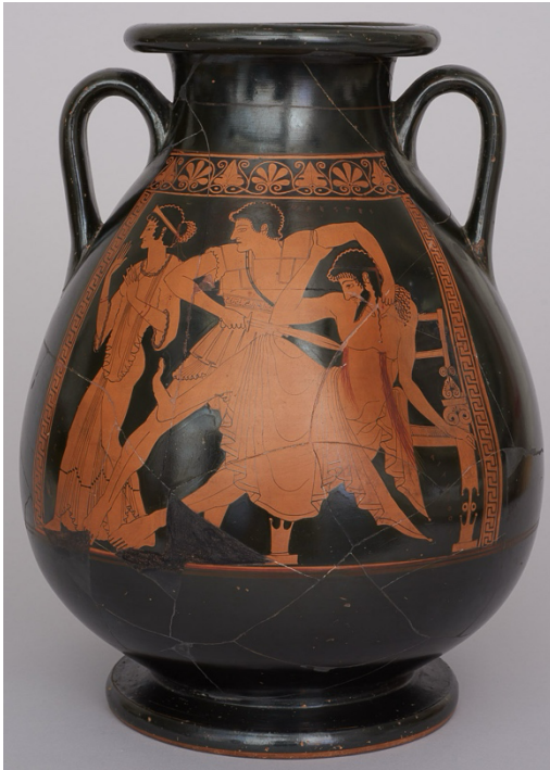
Image: Attic red-figure pelike, c. 500 BCE.