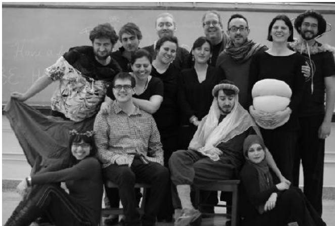
( http://donalddish.ca/wp-content/uploads/2014/03/don-quichotte-mcmanus-2.jpg )